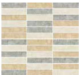
Light Blend 1x4 Mosaic on 12x12