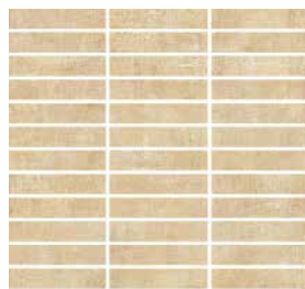
Solid 1x4 Mosaic on 12x12 Available in all colors