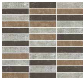
Dark Blend 1x4 Mosaic on 12x12