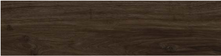
6" x 24" CENTURY WOOD CINNAMON HD RECTIFIED PORCELAIN TILE 62-523