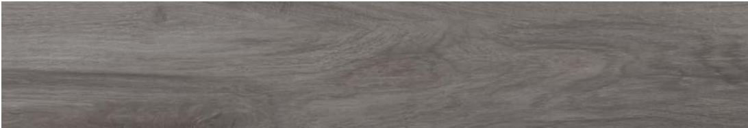
6" x 36" CENTURY WOOD ASH HD RECTIFIED PORCELAIN TILE 62-721