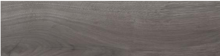
6" x 24" CENTURY WOOD ASH HD RECTIFIED PORCELAIN TILE 62-525