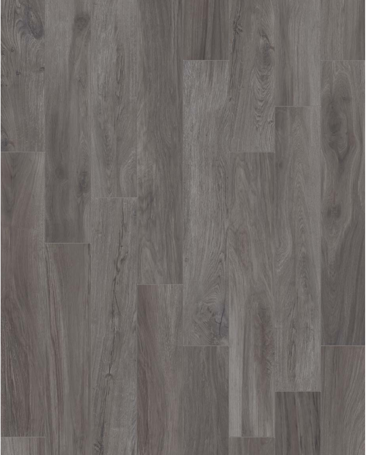
6" x 36" CENTURY WOOD ASH HD RECTIFIED PORCELAIN TILE