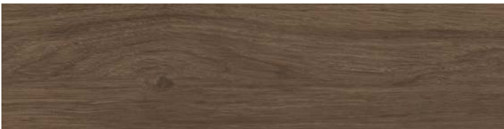
6" x 24" CENTURY WOOD SADDLE HD RECTIFIED PORCELAIN TILE 62-524