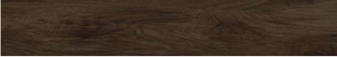
6" x 36" CENTURY WOOD CINNAMON HD RECTIFIED PORCELAIN TILE 62-719