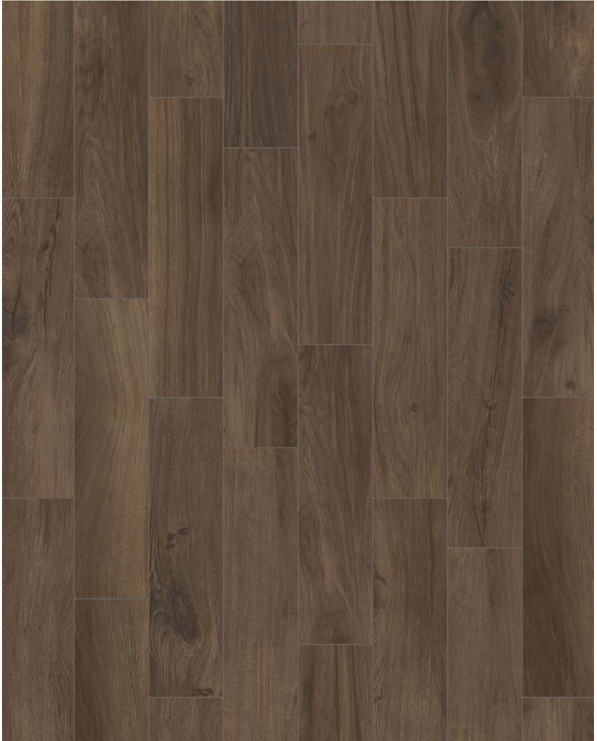
6" x 24" CENTURY WOOD SADDLE HD RECTIFIED PORCELAIN TILE