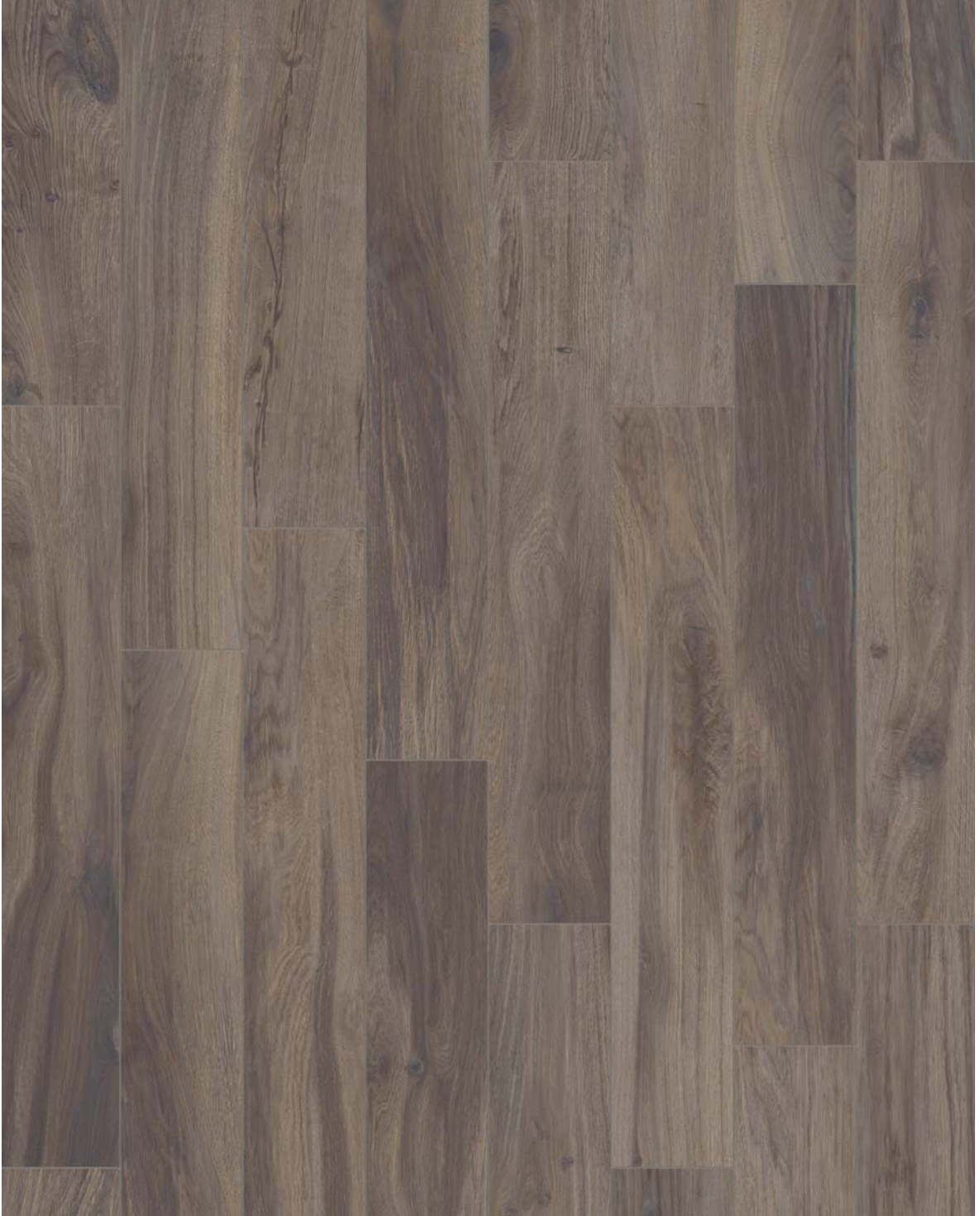
6" x 36" CENTURY WOOD DUNE HD RECTIFIED PORCELAIN TILE