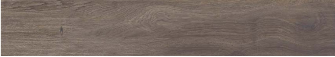
6" x 36" CENTURY WOOD DUNE HD RECTIFIED PORCELAIN TILE 62-722