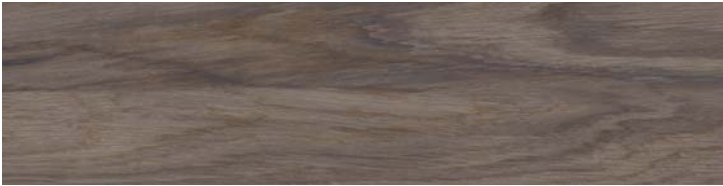
6" x 24" CENTURY WOOD DUNE HD RECTIFIED PORCELAIN TILE 62-526