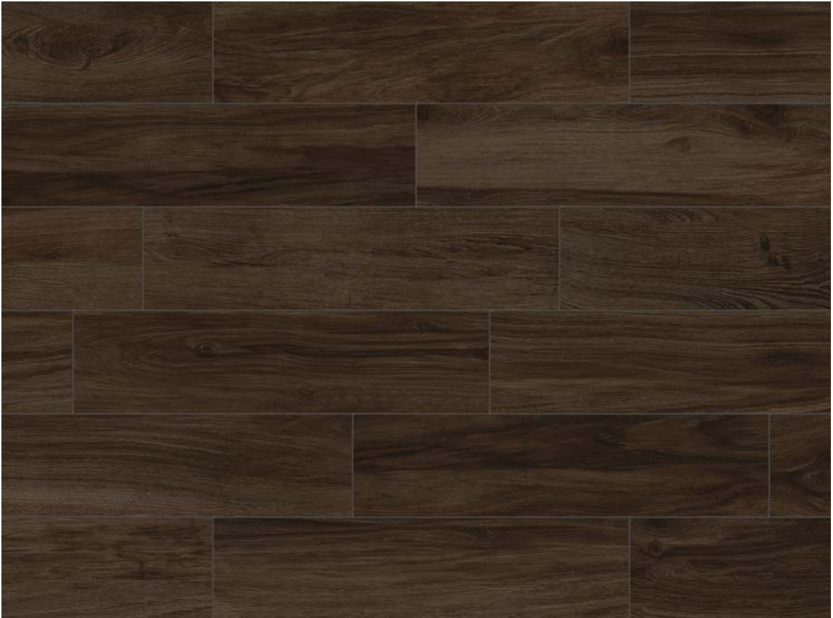
6" x 24" CENTURY WOOD CINNAMON HD RECTIFIED PORCELAIN TILE