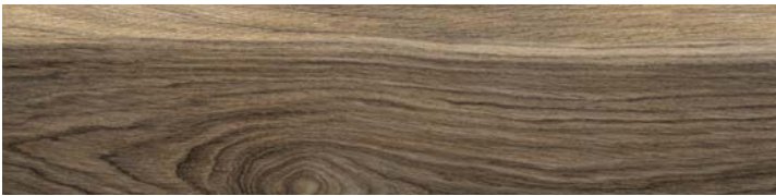
6" x 24" AMAYA WOOD TOBACCO HD PORCELAIN TILE 62-533