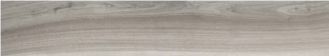
6" x 36" AMAYA WOOD ASH HD PORCELAIN TILE 62-736