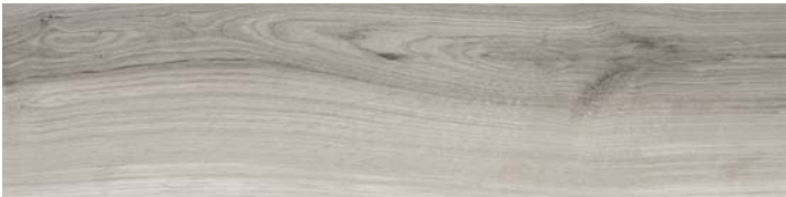
6" x 24" AMAYA WOOD ASH HD PORCELAIN TILE 62-537