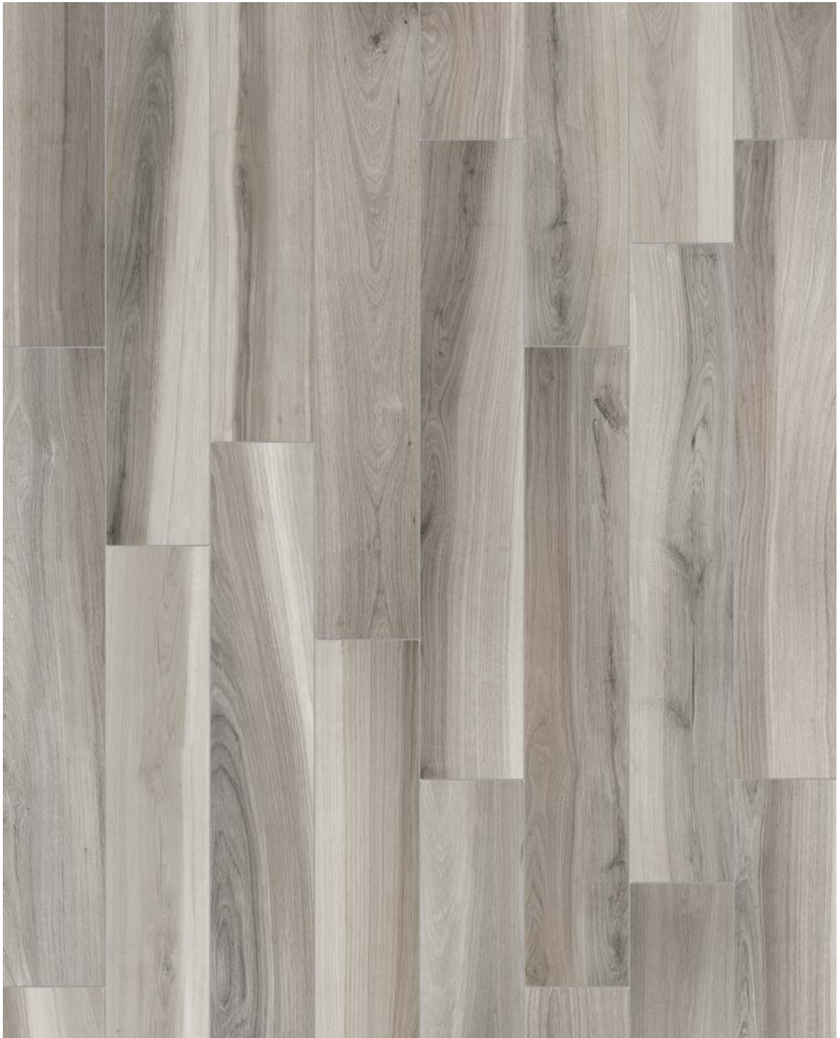
6" x 36" AMAYA WOOD ASH HD PORCELAIN TILE