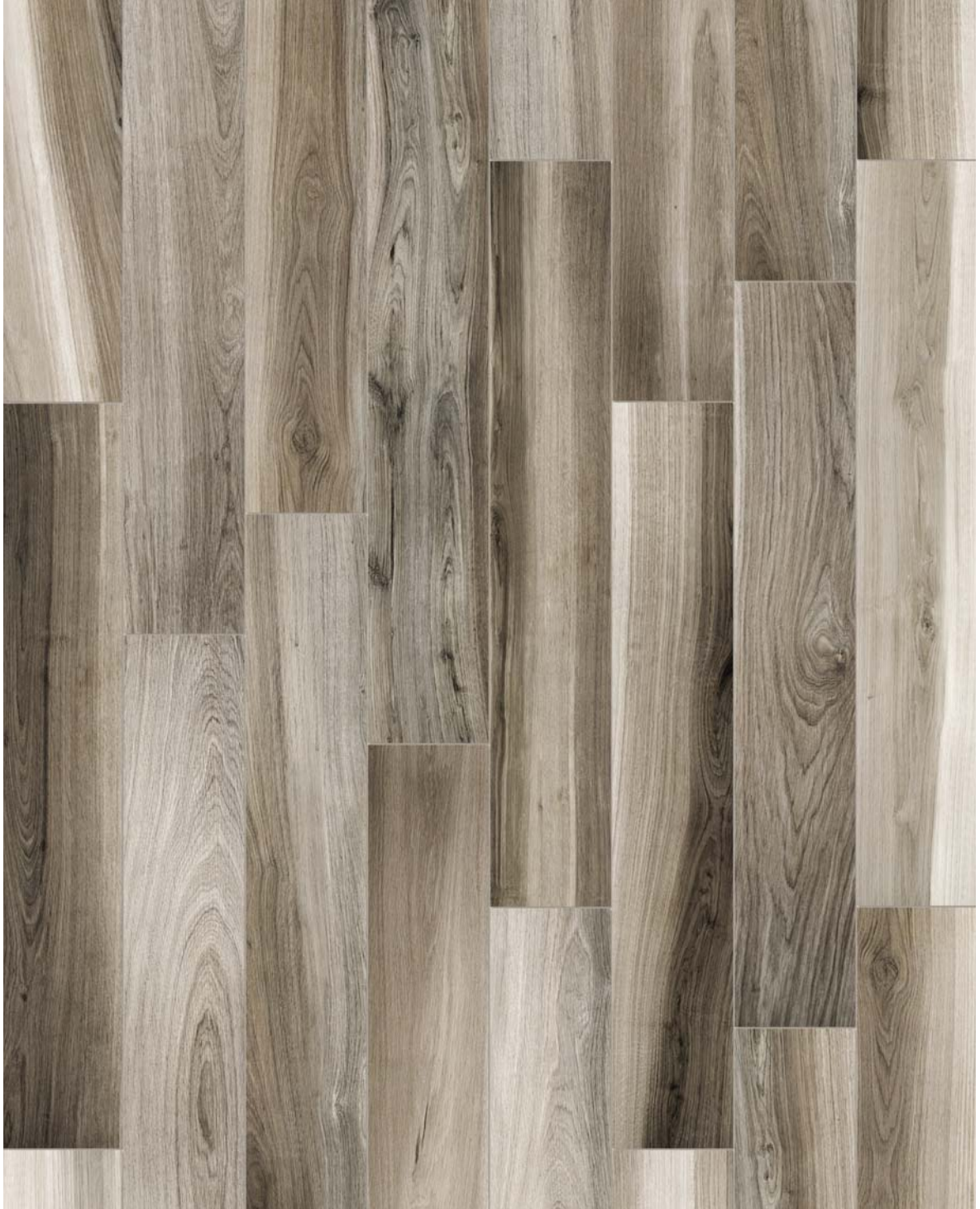
6" x 36" AMAYA WOOD BLEND HD PORCELAIN TILE