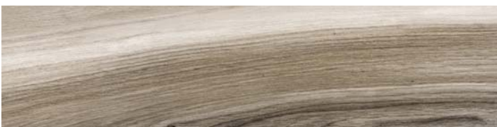
6" x 24" AMAYA WOOD BLEND HD PORCELAIN TILE 62-535