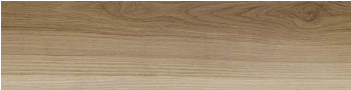
6" x 24" AMAYA WOOD NATURAL HD PORCELAIN TILE 62-536