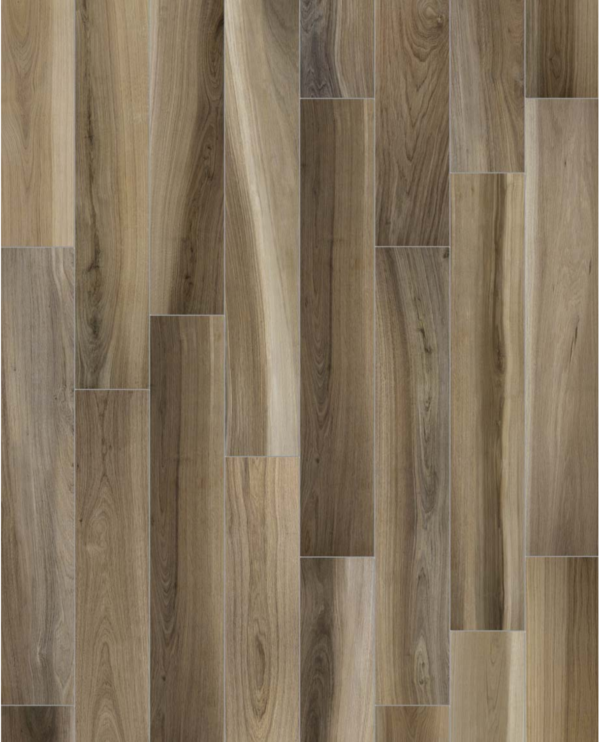
6" x 36" AMAYA WOOD WALNUT HD PORCELAIN TILE