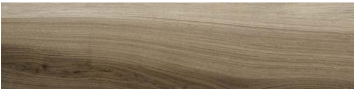
6" x 24" AMAYA WOOD WALNUT HD PORCELAIN TILE 62-534