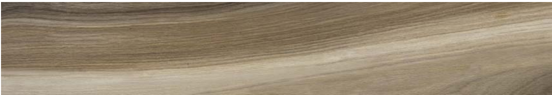
6" x 36" AMAYA WOOD WALNUT HD PORCELAIN TILE 62-733