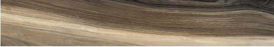
6" x 36" AMAYA WOOD TOBACCO HD PORCELAIN TILE 62-732