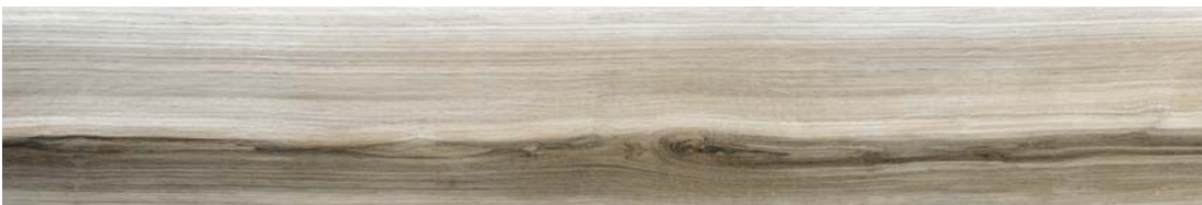
6" x 36" AMAYA WOOD BLEND HD PORCELAIN TILE 62-734