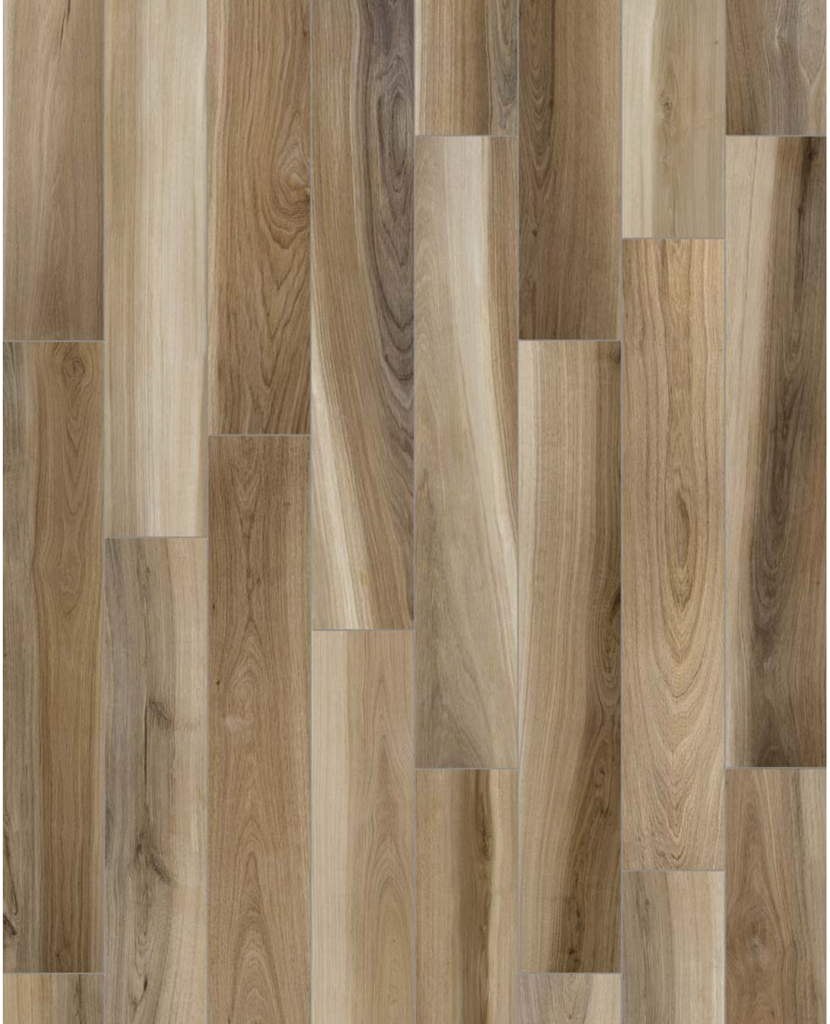
6" x 36" AMAYA WOOD NATURAL HD PORCELAIN TILE