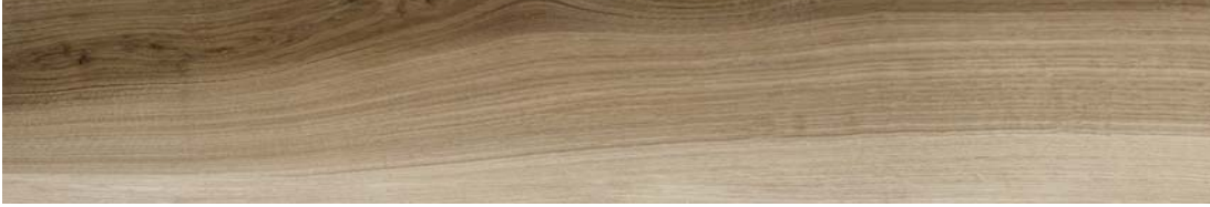
6" x 36" AMAYA WOOD NATURAL HD PORCELAIN TILE 62-735