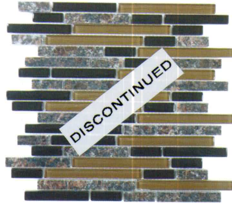
GG14 Mansion Facade