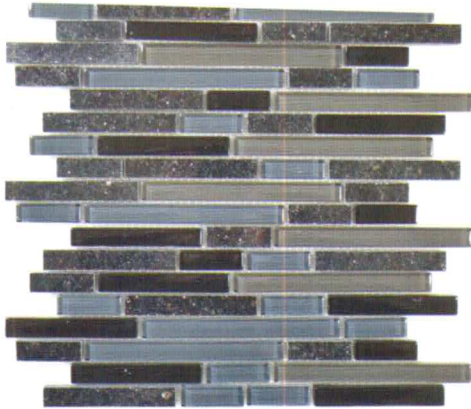
GG13 Urban Sidewalk